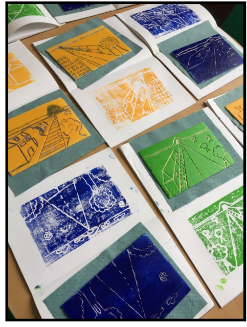
Examples of press prints.

These are examples of reduction printing - after you have printed the first colour, you 'reduce' (or cut away at) the block print and print over the first print (overlaying). Using this technique, your prints can have as many colours as you want!