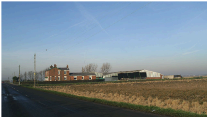
A farm in the countryside. Food is grown here or animals are kept.

Everton is not by the sea or in the countryside. Everton has more people houses.