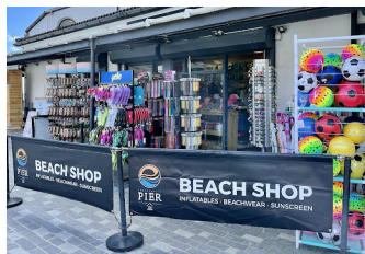
People build shops to sell things.