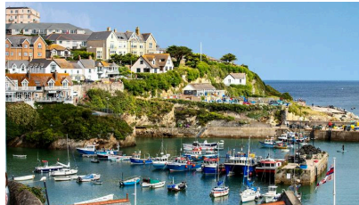
Harbours are built by people to keep boats safe.