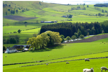
The countryside has lots of fields.