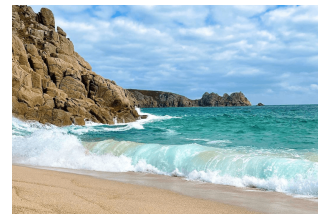
Cliffs are steep and rocky.