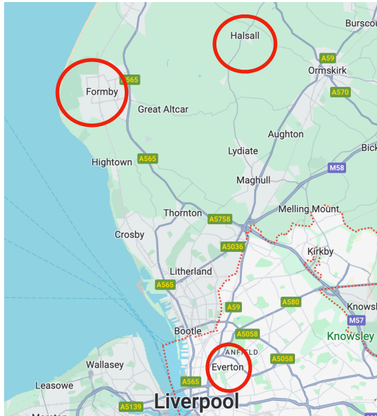
Map of Liverpool and the outskirts.

Seaside places are found by the sea. Places in the countryside have lots of land around them and have less people living there.