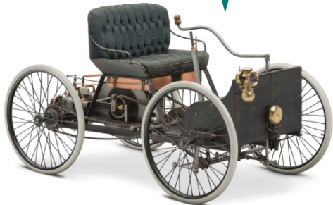
The Henry Ford Quadricycle (1896)