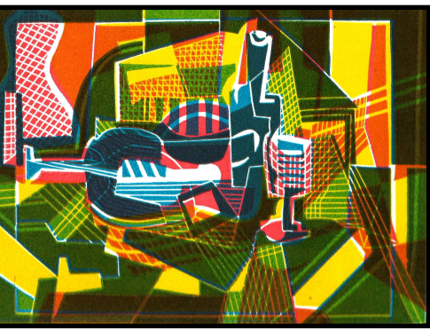
Dale Devereaux Barker specialises in reduction linocuts