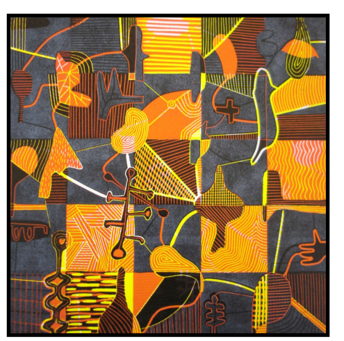
Belinda King combines screen printing, calligraphy, etching and relief printing