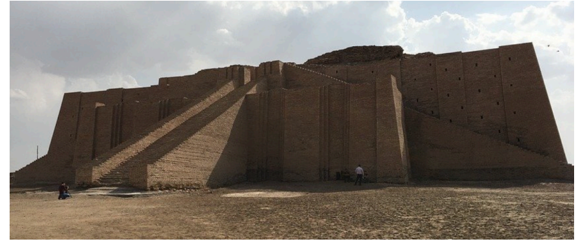
Examples of cradles of civilisation